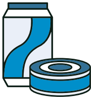
Aluminum + Tin Cans